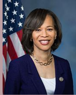
Sen. Lisa Blunt- Rochester