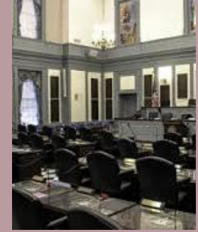
DE General Assembly