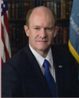
Sen. Chris A. Coons